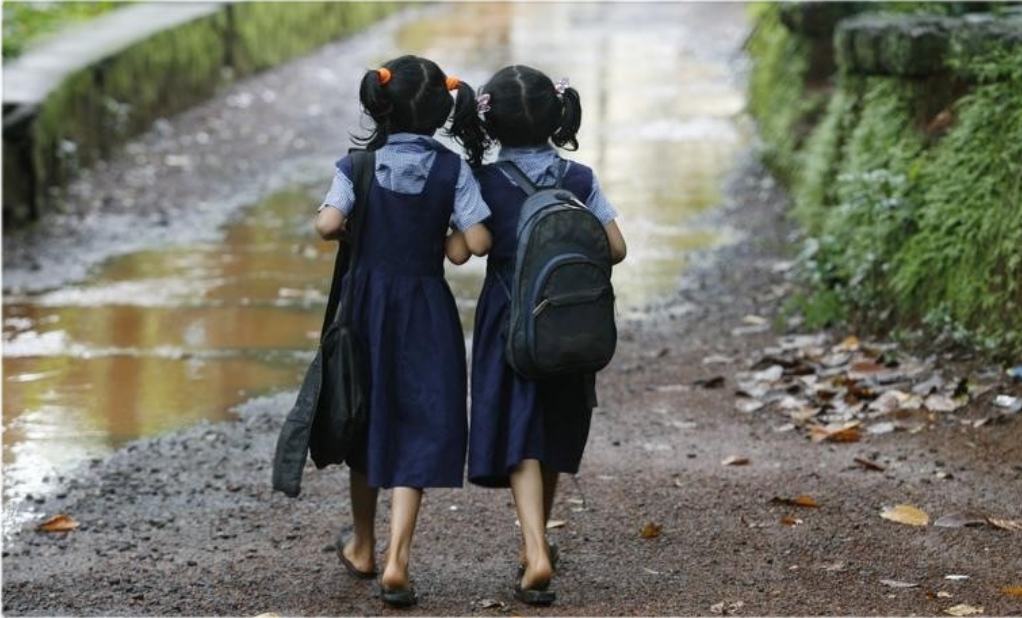
Girls walk to their school in Kerala.

A collaboration with Smt. RAJESWARI RADHAKRISHNAN CHARITABLE TRUST, INDIA